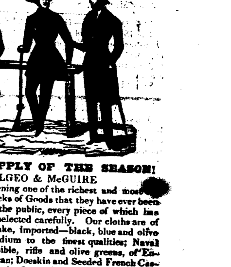
FIRST SUPPLY OF THE SEASON! ALGEO & MCGUIRE.