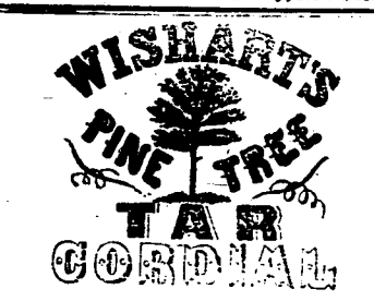
THE GREAT CURE FOR CONSUMPTON.