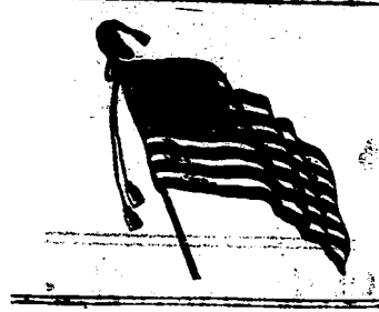
The Union as it was