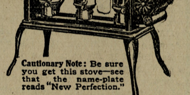
Cautionary Note: Be sure you get this stove—see that the name-plate reads "New Perfection."

Boils, bakes, or roasts better than any range. Ready in a second. Extinguished in a second. Fitted with Cabinet Top, with collapsible rests, towel rack, and every up-to-date feature imaginable. You want it, because it will cook any dinner and not heat the room. No heat, no smell, no smoke, no coal to bring in, no ashes to carry out. It does away with the drudgery of cooking, and makes it a pleasure. Women with the light touch for pastry especially appreciate it, because they can immediately have a quick fire, simply by turning a handle. No half-hour preparation. It not only is less trouble than coal, but it costs less. Absolutely no smell, no smoke; and it doesn't heat the kitchen.