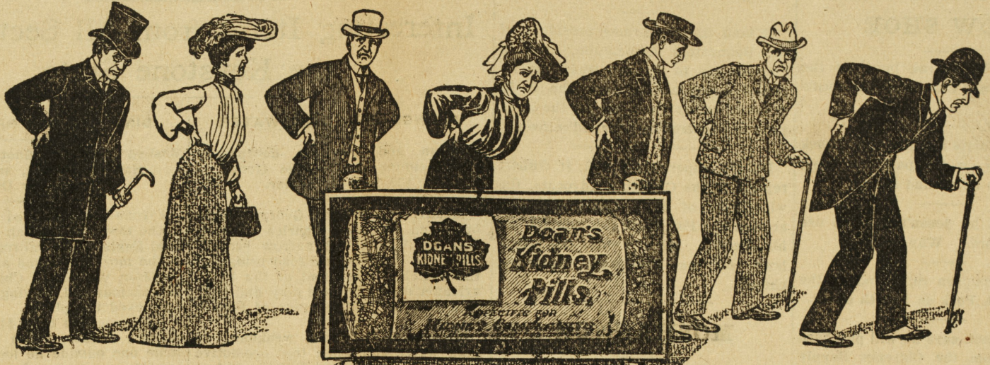
(Fac-simile of the genuine package slightly reduced.)

All the guests at a wedding at South-end-on-the-Sea, England, brought fishing rods, and the bride and bridegroom, both members of the Scotland Angling Society, passed beneath an arch of fishing rods on leaving the church.