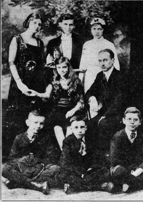
THE PRINCIPAL CHARACTERS

One of the most interesting features of the Christmas week program at Grace Methodist Episcopal Church, Third near State street, will be the entertainment to be given to-morrow evening at 7.15 o'clock when a number of young people of the church present Kate Douglas Wiggin's familiar sketch, "The Birds' Christmas Carol."