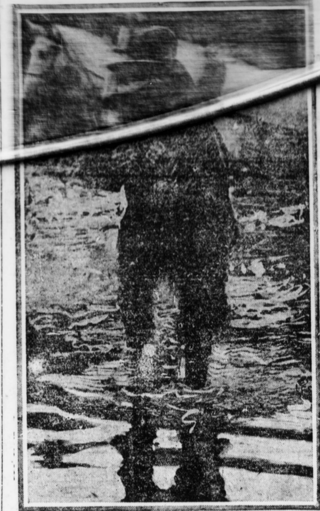
Driven by easterly winds which had prevailed for several days, the highest tide in the memory of waterfront workers backed into the Hudson and East Rivers and flooded large areas in lower New York and Hoboken. For several hours ferriesboats were unable to make their slips in New Jersey and thousands of commuters were forced to take the tube. The water in some places was knee deep in the streets. This photograph shows a rubber-boated traffic policeman giving a sponge to a lift.