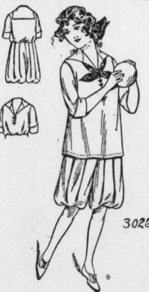
A SERVICEABLE MODEL

3026—Girl's Gymnasium Suit. Comprising a smart Middy Blouse, which may be finished to the waistline only, and a pair of comfortable, neat bloomers, cut with ample fulness. For the blouse, one could use madras, linene, linen, serge or flannel. For the bloomers, serge, cashmere, brilliantine or saten is desirable. The Pattern is cut in 5 sizes: 8, 10, 12, 14 and 16 years. It requires 3 1/2 yds of 27-inch material for the Blouse and 2 3/8 yards for the Bloomers, for a 12 year size. A pattern of this illustration mailed to any address on receipt of 10c in silver or 1c and 2c stamps.