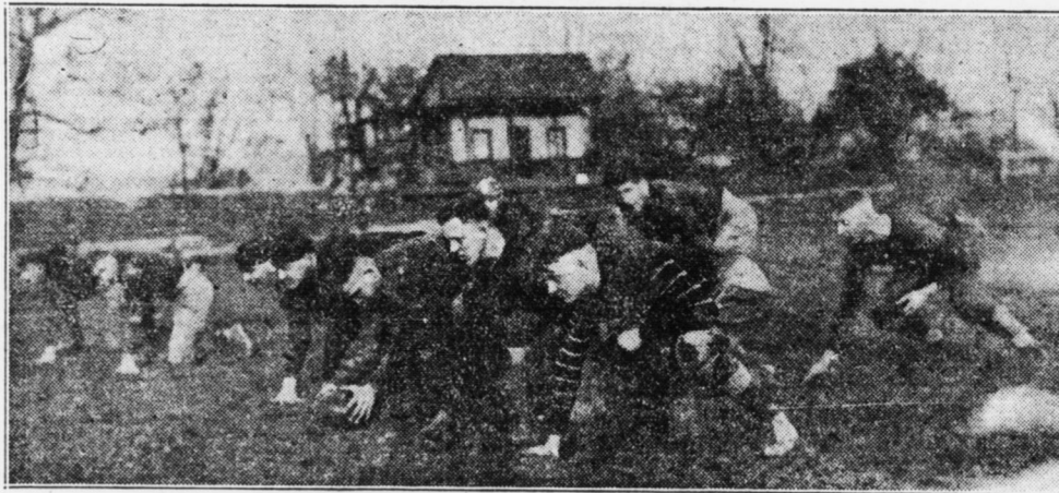
TECH H TEAM LINEUP READY FOR ACTION