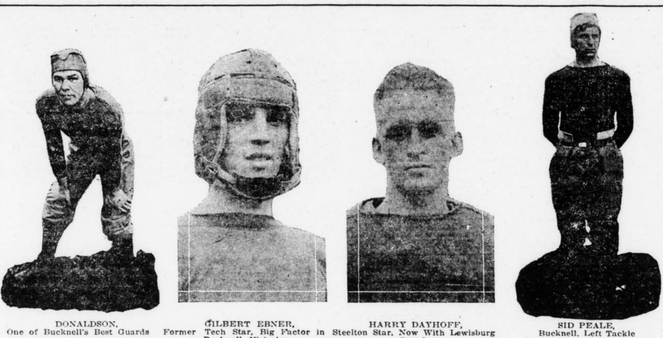
BUCKNELL STARS WHO WILL BE IN SATURDAY'S GAME