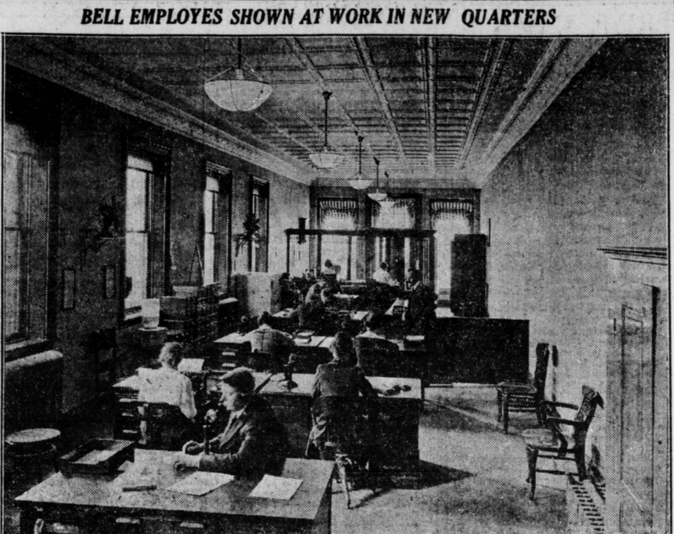
Above are shown the new commercial quarters of the Bell Telephone Company of Pennsylvania, 206 North Third street. These were recently removed from 210 Wain ut street.

signals will display the block station call during the daytime and a red and yellow light twelve inches apart in a horizontal line directly over the block station call at night.