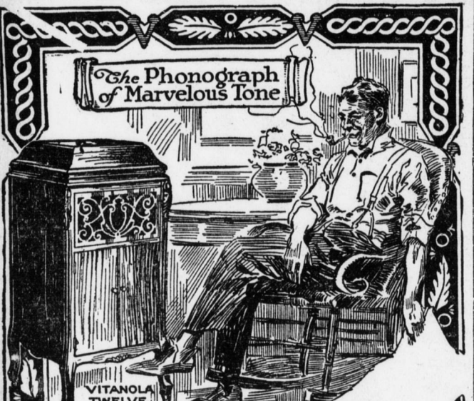
The Phonograph of Marvelous Tone

NO INCREASE IN PRICES—10 AND 20c AS USUAL