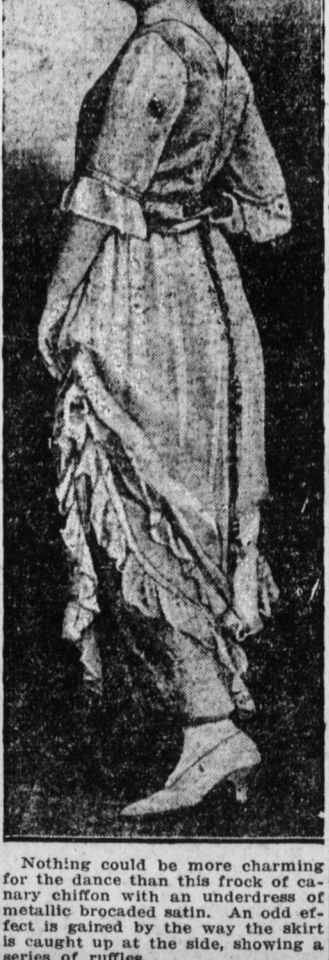
Nothing could be more charming for the dance than this frock of canary chifon with an underdress of metallic brocaded satin.