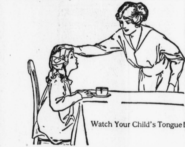
Watch Your Child's Tongue!