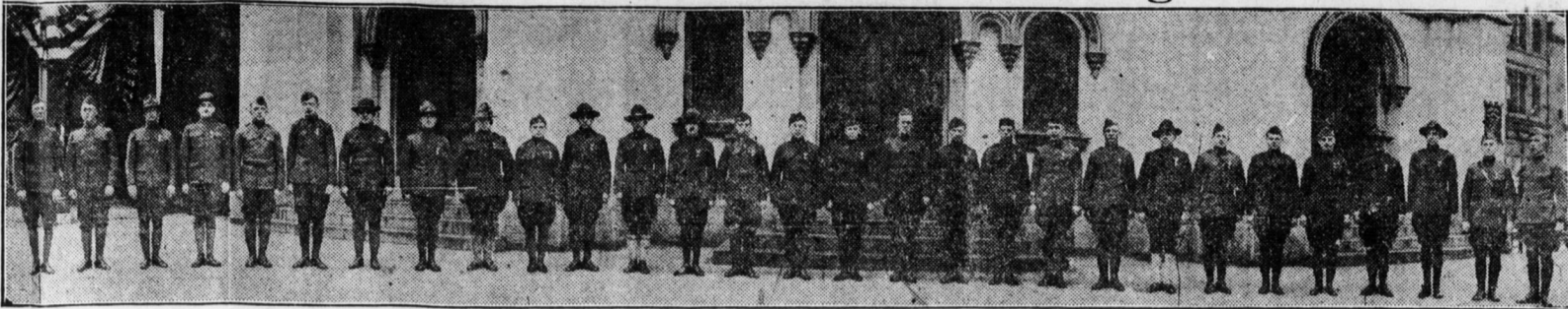
The above picture shows the line-up of the service men who went out from the Bell Telephone Company in this city at the beginning of hostilities.

before the President's industrial conference on October 6 at the White House and before the International Labor Congress, which begins October 29 in Washington.