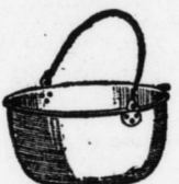
Preserving Kettle, about 6-qt. capacity; $1.39.