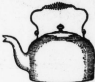
Tea Kettle, about 5-qt. capacity; $1.75.