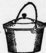
Windsor Kettle with cover; about 6-qt. capacity; $1.49.