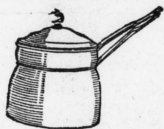
Double Cereal Cooker; about 1 1/2-qt. capacity; $1.35