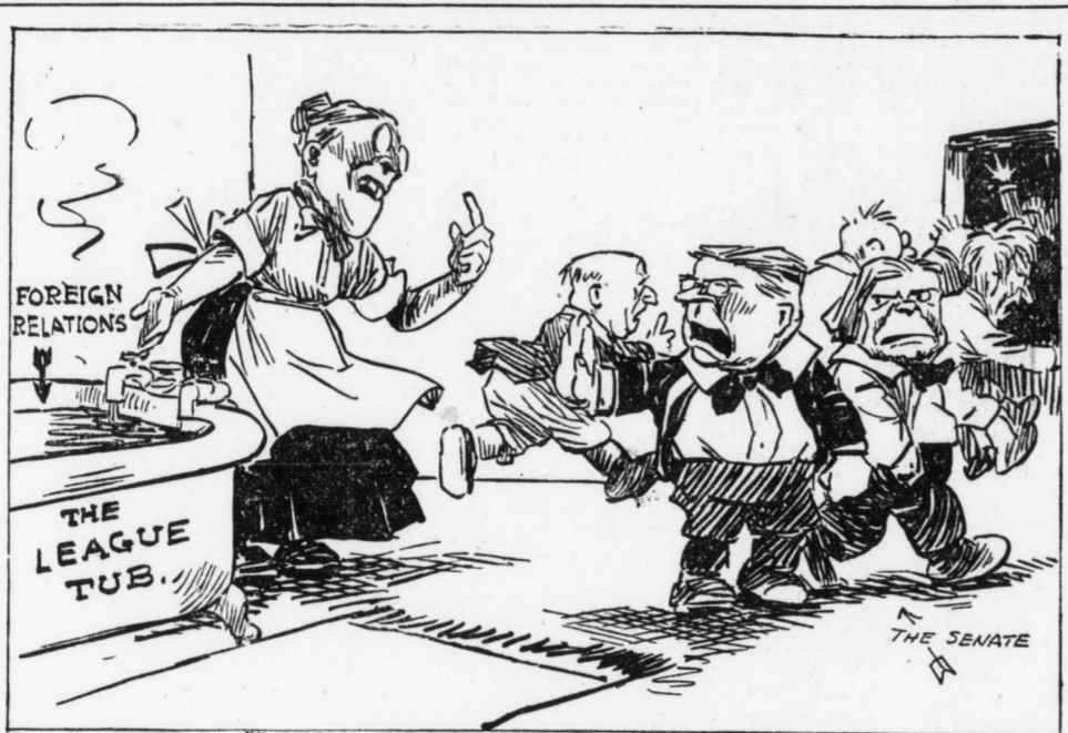
SO AFRAID OF THE WATER WHEN IT'S IN A TUB.