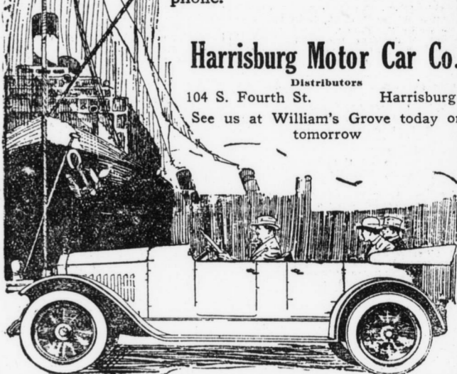
Harrisburg Motor Car Co. 104 S. Fourth St. Harrisburg. See us at William's Grove today or tomorrow.

In all the history of mechanical arts, no other record is given of worth increasing as operation continues. Yet in the Stearns Sleeve Valve Motor, this attribute is universally acknowledged.