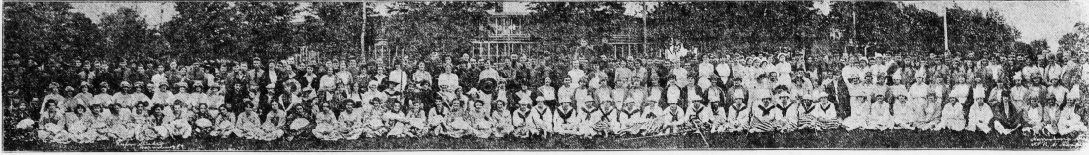
Included among the girls who entertained convalescent soldiers at the Carlisle Army Hospital on Saturday under the auspices of the War Camp Community Service, were girls employed by the Harrisburg Cigar Factory, Harrisburg Shoe Company, New Idea Hosiery Company, City Star Laundry, Harrisburg Silk Mill, and members of the Girl Scouts.

Internal control of trade and also the idea suggested in America of stamping goods with factory prices and establishing a system of fixing prices. He admitted that the government had no alternative but to confess it was powerless under the laws as they stand at present.