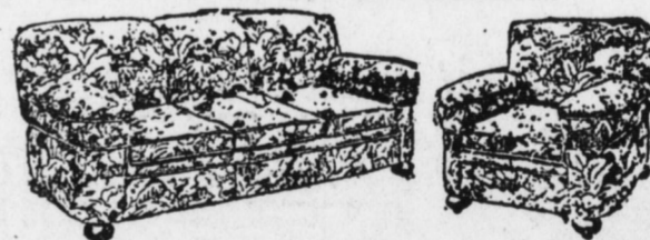
BOWMAN'S—Fifth Floor for Fine Furniture.

Cotton combination mattress; one or two parts; all sizes. August Furniture Sale, $7.95.