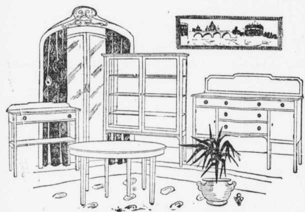
Antique Mahogany Finish. Beautiful plain, straight lines