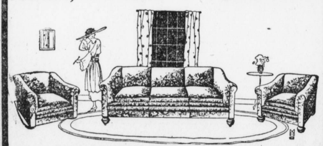
Loose Spring-Cushions, Spring Edges, Seats and Backs. Very deep, comfortable seats. High-grade silk finished Tapestry

Tapestry Over-Covered $250.00 Suites, 3 Pieces . . . $250.00