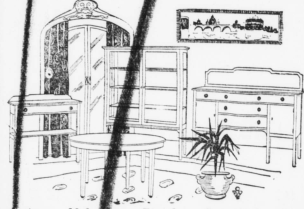
any Finish. Beautiful plain,