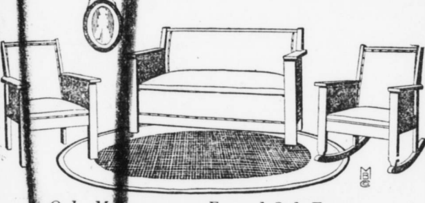
Oak, Malogany or Fumed Oak Frames. Upholste ed with Muleskin or Tapestry

Tapestry Over-Covered $250.00 Suites, 3 Pieces . . . $250.00 Pieces