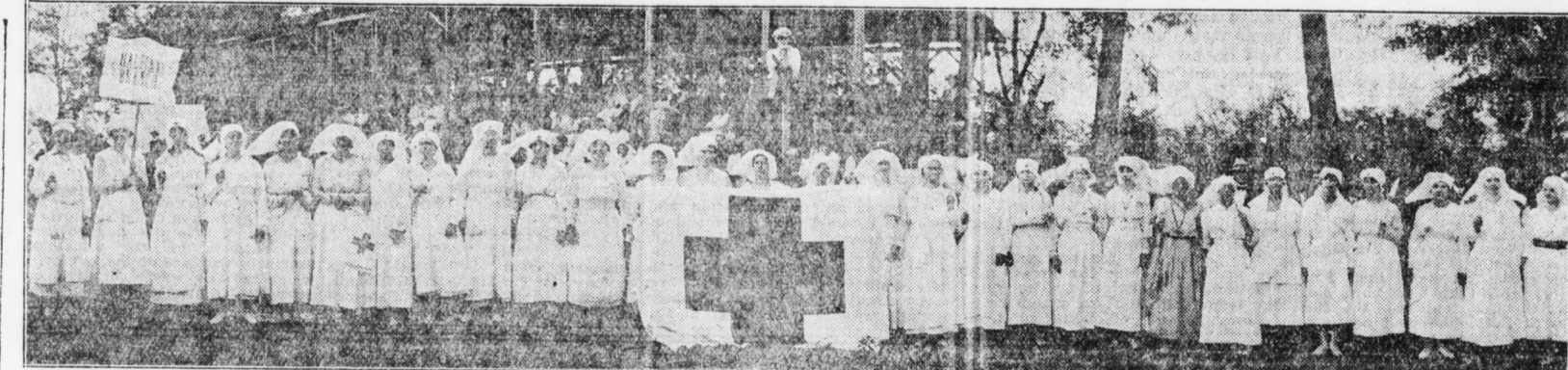
Halifax proudly honored its fighting men Saturday with a great welcome home festival, during which the men who have returned from the service were the guests of honor. Honor also was paid by the borough to the women war workers who served well at home. The photographic reproductions show the returned soldiers and the women war workers as they appeared after the parade.

"Great heavens, Mr. Gloom!" ejaculated an acquaintance. "Are you contemplating exploring some vast and dismal cavern?"