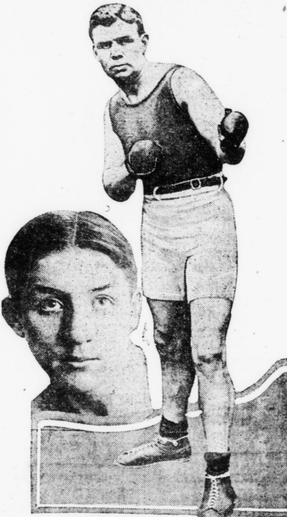
Latest photos of Beckett and (insert) Carpenter, who are to meet. The winner will probably be the next opponent to Dempsey.