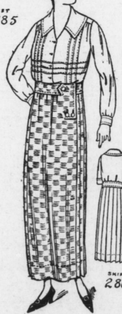
A BECOMING BUSINESS COSTUME

Waist 2885, Skirt 2865. In this you have a smart shirt waist coupled with a comfortable, stylish skirt. Sport's silk, serge, linen, voile or gabardine could be used for the skirt and linen, crepe, voile, satin, fannel, batiste or chambray for the waist.