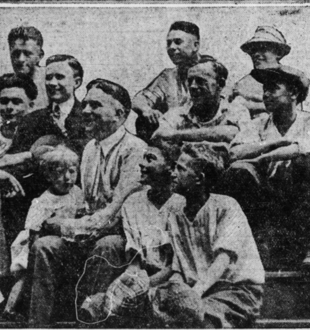
Jack Dempsey telling group of admirers how he did it.