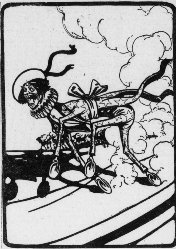
"It's a Wheeler!"

Editor's Note—Our next story—"The Tiktok Man." Read how Dorothy and Billina escape from The Wheelers. Then they make use of The Golden Key. A cave is discovered, as well as the "Tiktok Man." Read about his cruel master, his imprisonment and rescue by Dorothy.