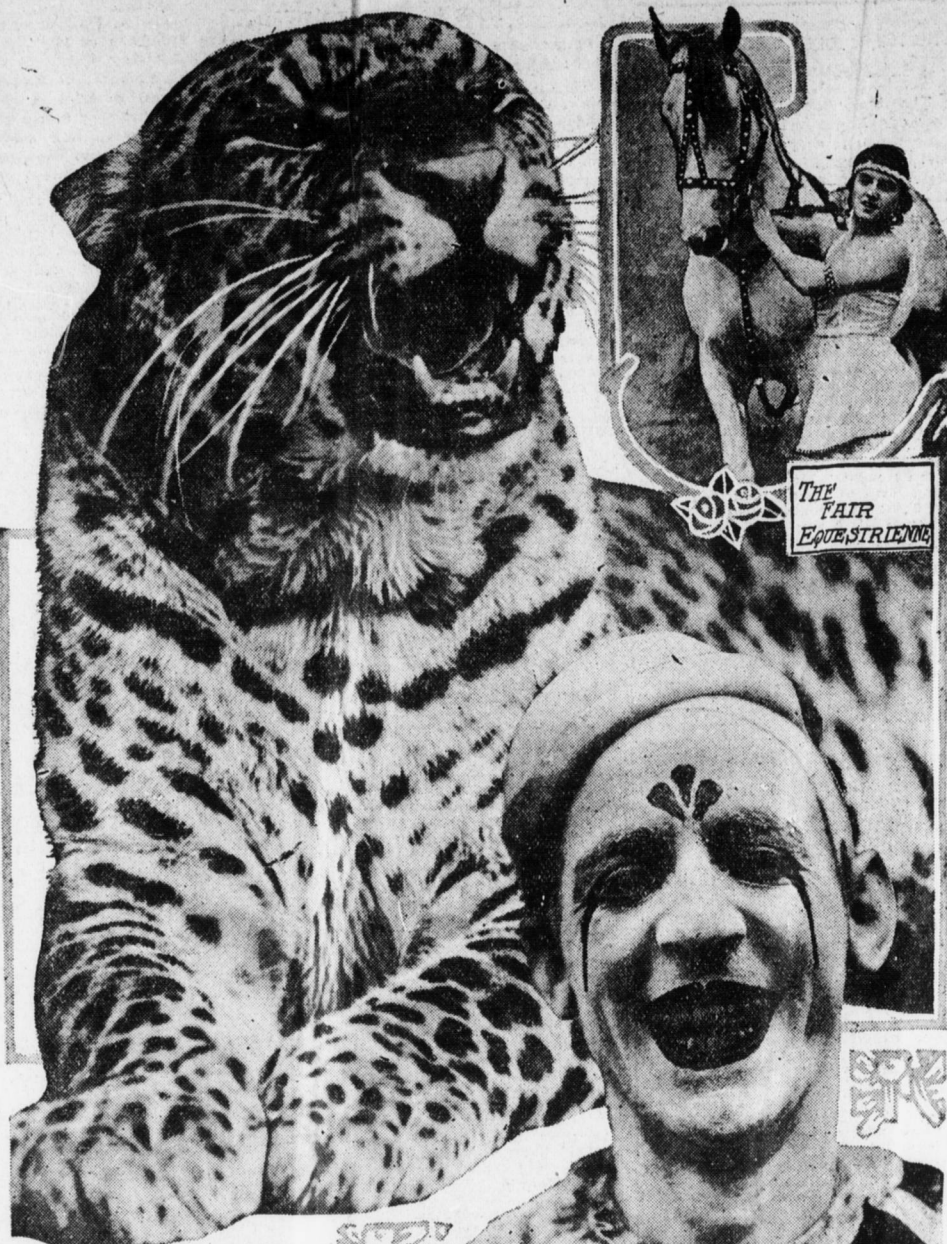
A MONARCH OF THE JUNGLE