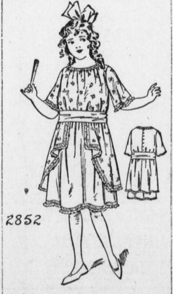
A PRETTY FROCK FOR THE LITTLE MISS

2852—This design is pretty for dotted Swiss, for dimity, organdie, lawn, silk, voile and batiste. As here shown, figured and plain voile are combined with “Val” lace and insertion for trimming. The tunic may be omitted.