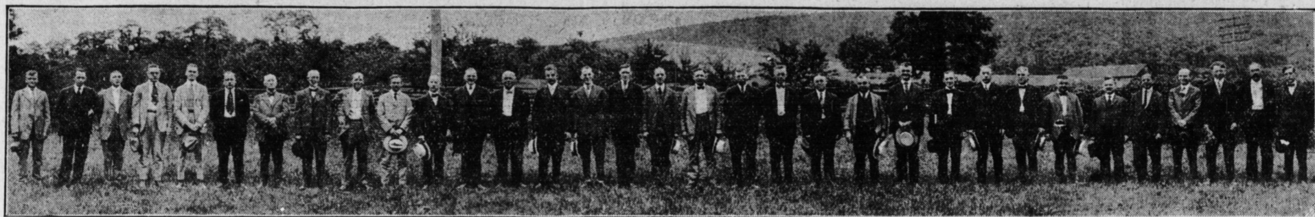
Almost fifty members of the Harrisburg Coal Exchange were in attendance at the nineteenth annual outing of the organization held at Inglebrook yesterday.

In announcing its new all-season cars, the Cole Motor Car Company presents a series of automobiles which afford distinctly new advantages in enclosed car design.