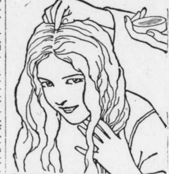
Let Cuticura Save Your Hair