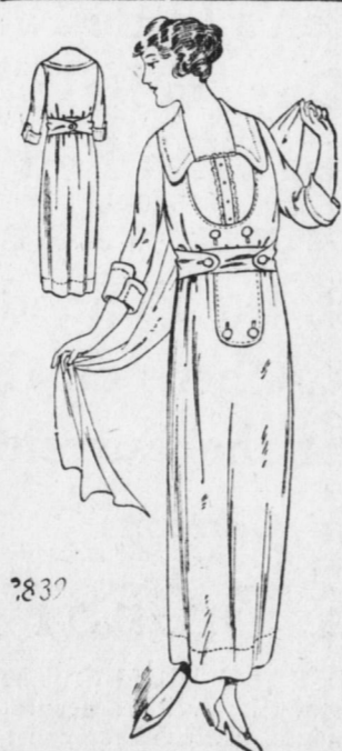
A PRETTY STYLE FOR SILK OR CLOTH

2839—Taffeta, foulard or satin, could be combined in this model, with other suitable material, or one material used, could have trimming in a contrasting color. One could have this stylish model in shantung, linen or gingham, with a chemise of batiste, organdie or net. The belt is a new style feature.