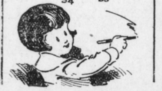
Draw from one to two and so on to the end.