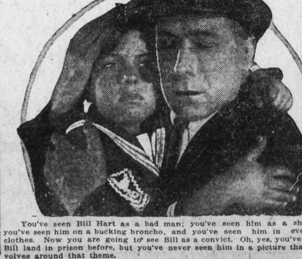
You've seen Bill Hart as a bad man; you've seen him as a sheriff; you've seen him as a bucking broncho, and you've seen him in evening clothes. Now you are going to see Bill as a convict. Oh, yes, you've seen Bill land in prison before, but you've never seen him in a picture that revolves around that theme.