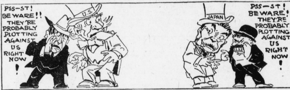
AND IT DOESN'T TAKE MUCH OF A PLANTING OF SUSPICION.