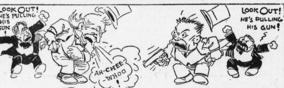
AND THEN LET SOMEBODY SNEEZE AND REACH FOR HIS HANDKERCHIEF—