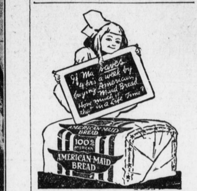
Figure it up— means one day every three weeks, or 17 days every year, wasted; buy