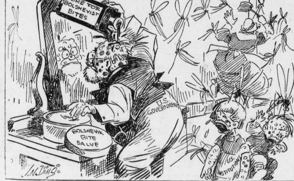
A POUND OF MOSQUITO BITE CURE