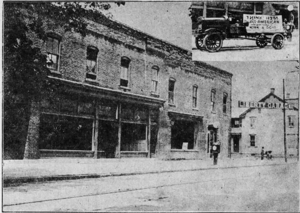
The above illustration shows the new Liberty Garage, at the corner of sixteenth and Walnut streets, formerly the Russ Bros. ice cream plant, that has been remodeled and turned into an up-to-date garage by Kirk & Ochs, local distributors for Cole, Liberty and All-American cars. The garage is not yet ready for occupancy, but work is expected to be finished in a very short time. The insert in the cut is that of the All-American Truck.

"I would not attempt to forecast the future. But this I will say. We shall not voluntarily relinquish the position of dominance we have thus acquired. To maintain that position, we must increase our truck output to keep pace with the constantly increasing demand—and even now our production is running more than 50 per cent. stronger than the record figures for the first quarter.