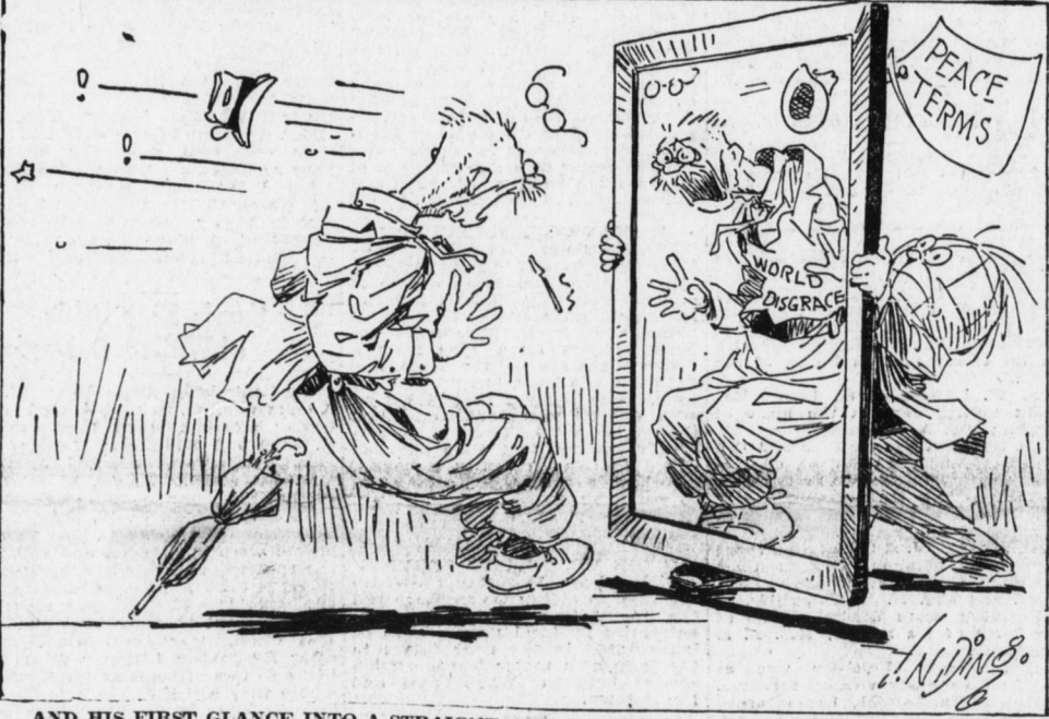
AND HIS FIRST GLANCE INTO A STRAIGHT ONE IS NATURALLY SOMETHING OF A SHOCK.