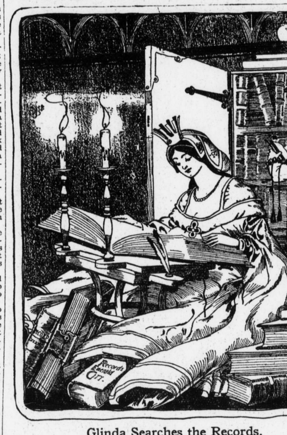
Glinda Searches the Records.

gladly to discover where this girl is hidden," resumed the Sorceress thoughtfully. "I have in my library a book in which is inscribed every action of the Wizard while he was in our Land of Oz—or, at least, every action that could be observed by my spies. This book I will read carefully to-night, and try to single out the acts that may guide us in discovering the lost Ozma. In the meantime pray amuse yourselves in my palace and command my servants as if they were your own. I will grant you another audience to-morrow."