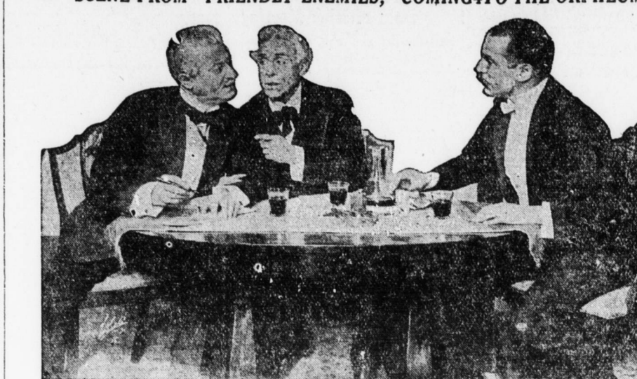
One of the most noteworthy events of the present theatrical season is the coming to this city on Friday and Saturday, at the Orpheum, of "Friendly Enemies." This is a timely and essentially a truthful document in which the German dialect is turned against itself and in which Hun venom is used as its own antidote.