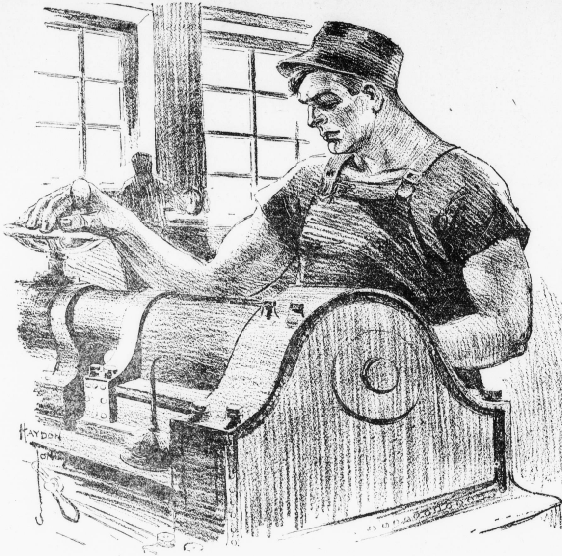
Look Out for the Snake