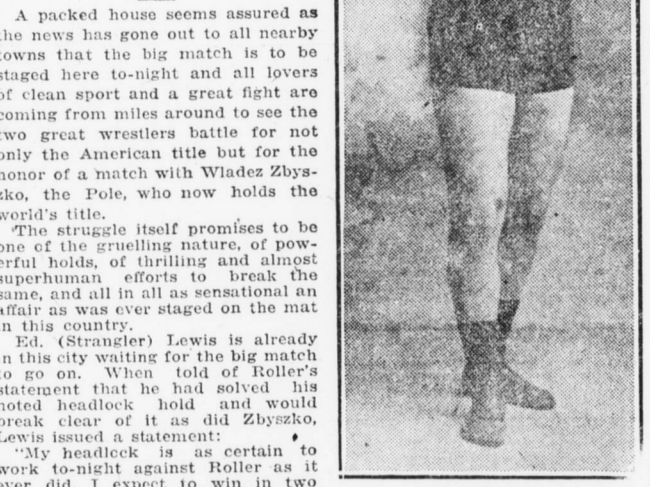
ED. "STRANGLER" LEWIS