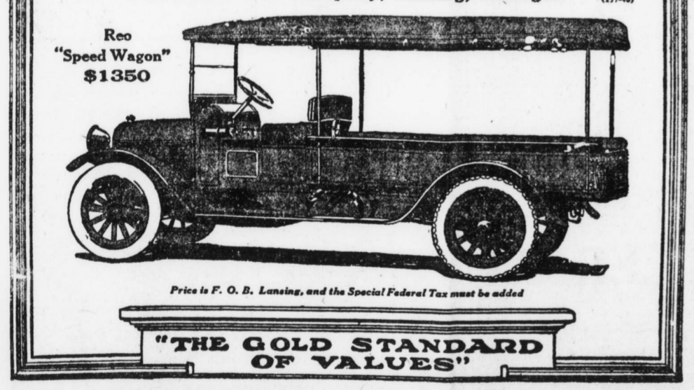
Price is F. O. B. Lansing, and the State Federal Tax must be added "THE GOLD STANDARD OF VALUES"

Harrisburg Automobile Co. 4th & Kelker Sts., Harrisburg, Pa. Reo Motor Car Company, Lansing, Michigan (17-40)