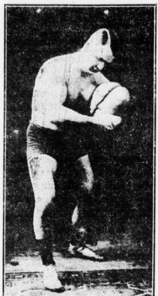
"STRANGLER" LEWIS Training With His Favorite Dummy

to-day at the Schenk and Tittle sporting goods store and at George Harry's cigar store.