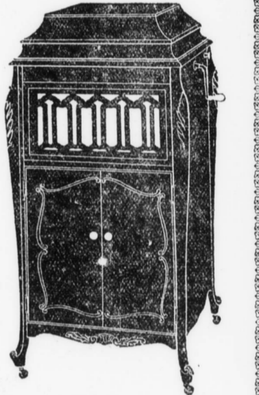
EMPIRE The Machine That Plays Any Disc Record $1.50 Will Enroll You as a Member of the Club.

Join the Big Empire Talking Machine Club now in full swing at 317 CHESTNUT STREET before it's too late. This Club plan Sale offers to The Public the convenience of securing a beautiful EMPIRE TALKING MACHINE That Plays All Makes of Disc Records. $1.50 will enroll you as a member. Come to Our Store at 317 CHESTNUT STREET and learn how you really can have one of these beautiful Cabinet Machines in your home for a small outlay. JOIN NOW—TODAY DON'T put it off any longer—the Machines are here for your approval.