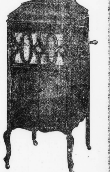
EMPIRE The Machine That Plays Any Disc Record $1.50 Will Enroll You as a Member of the Club.

6 Records, 12 Selections Sapphire Point Ball—200 Steel Needles Hundreds of new and up-to-date Records for you to choose from. Just a word about the Beautiful Case Designs and Finishes. They can be had in Mahogany, Golden Oak, Fumed Oak, and in fact they can be had in Finishes and Designs to Suit the Purchaser. You Are Invited Come to our store—bring your friends with you—let us prove to you that the EMPIRE Talking Machine and Empire Records make an ideal combination for any home. Empire concerts are held daily. Slightly used talking machines of several different makes that can be bought at a low price. These are all bargains, so come early.