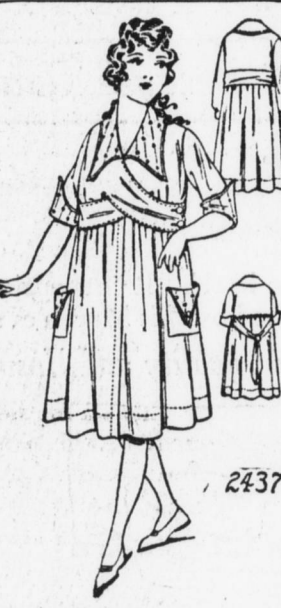
JUST THE DRESS FOR YOUR GROWING GIRL

2437—Here is comfort, good taste and good style. The model is nice for the new, pretty, voiles, for dimity, tulle, silk, batiste and dotted Swiss. The surplus effect on the waist is very pleasing. You may finish the dress with a belt over the back or with a smart sash of ribbon, silk or material.