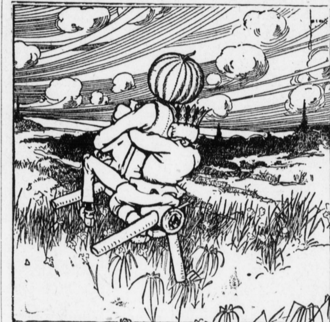
The Saw-Horse Rocked and Rolled over the Fields.

"They are all dead, so it doesn't matter," replied the Scarecrow.