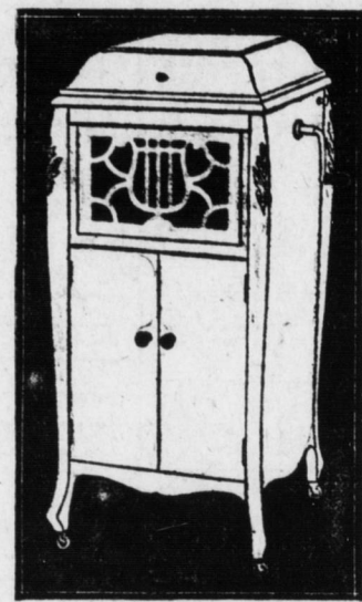
EMPIRE The Machine That Plays Any Disc Record