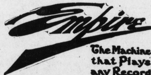
The Machine that Plays any Record

are finished in Mahogany, Golden Oak, Fumed Oak, in many Beautiful Design Cases.