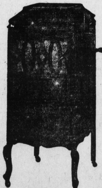
EMPIRE The Machine That Plays Any Disc Record

To out-of-town buyers within a radius of 50 miles we will allow carfare on the purchase.