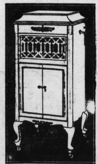
EMPIRE The Machine That Plays Any Disc Record

We have them and are going to sell them to you at prices that will surprise you when you make comparisons. We still have several Beautiful Pianos from the Winter Stock that must be sold. Come in early and get one of them. This is your chance to buy as we have the stock. Don't fail to come in.