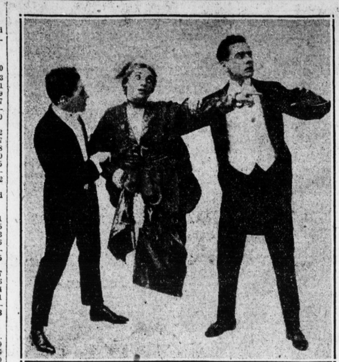
A scene from "Charley's Aunt," a comedy with music, showing at the Orpheum Monday matinee and night.