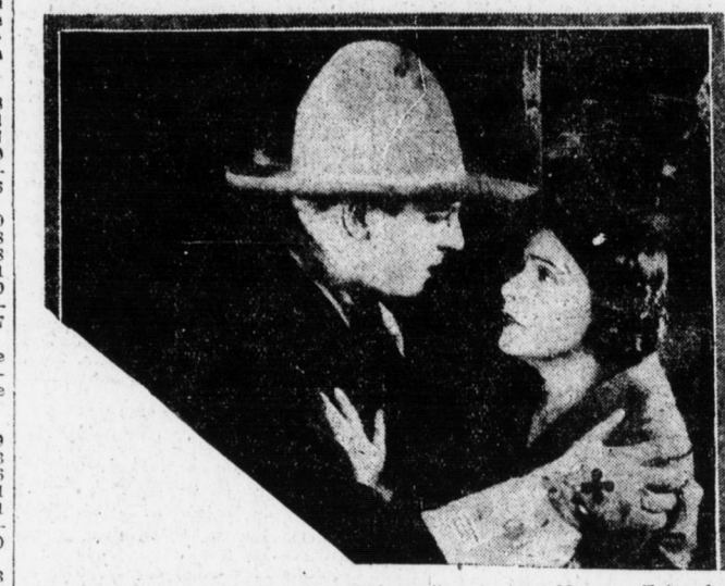
Scene from "The Heart of Wetona," starring Norma Talmadge. Showing at the Colonial tonight and tomorrow.