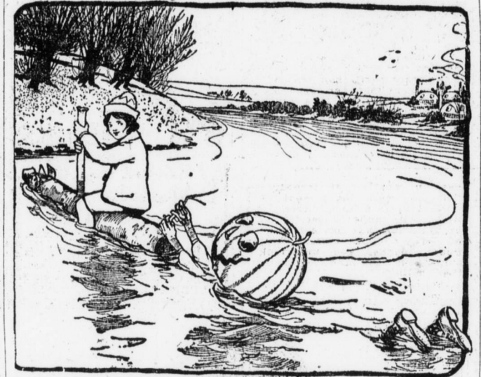
TIP AND JACK NEEDED NO FERRY-BOAT

Tip noticed that the purple tint of the grass and trees had now faded to a dull lavender, and before long this lavender appeared to take on a greenish tinge that gradually brightened as they drew nearer to the great city.