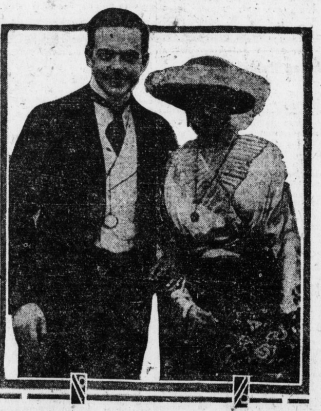
Cable reports tell of what seems to be a well-organized effort to restore King Manuel to the throne of Portugal. Some dispatches say that his representatives issued a manifesto discouraging the leaders of the royalist party, others that he left England for Portugal. While in exile in England he married Princess Victoria Augusta of Hohenzollern. The woman who will be queen of Portugal if the revolution is successful is seen here with the deposed King.